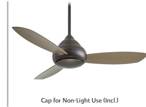
Cap for Non-Light Use (Incl.)